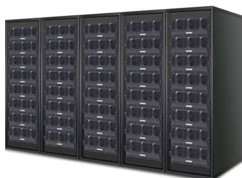
Integrated Cluster Solution